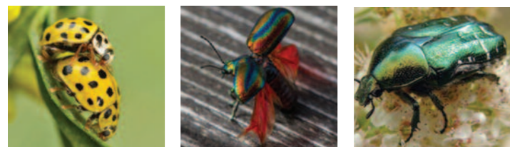
22 spot ladybird Rainbow leaf beetle Rose chafer beetle